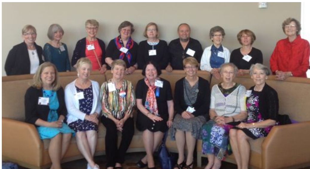
Colorado Delegation to LWVUS Convention 2014